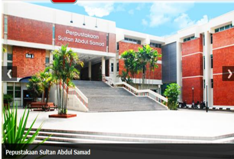
Pepustakaan Sultan Abdul Samad